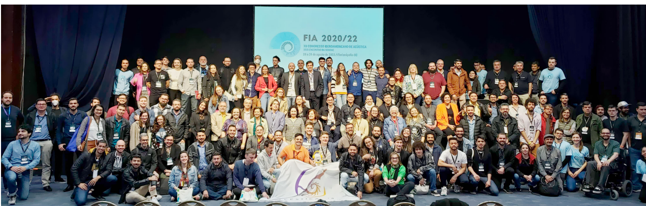
(i) FIA 2020/22 participants at the Closing Ceremony.