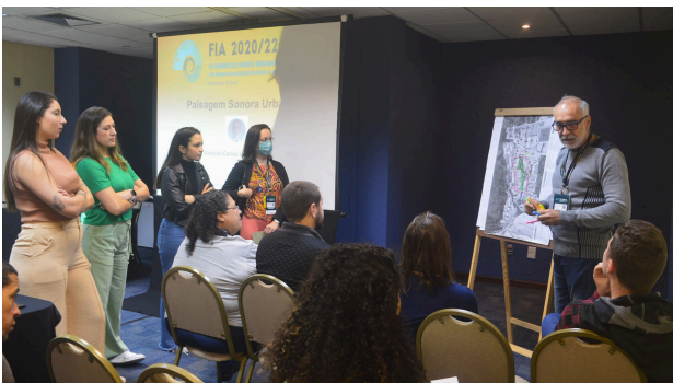
(a) Record of a mini-course conducted.

Finally, the Closing Ceremony of the congress took place (Figures 3 (i) and 4), and the farewell to the 12th Ibero-American Congress on Acoustics was marked by excitement and satisfaction among all the organizing committee and other event participants, who contributed to making the four days full of conversations, debates, and study, concluding the FIA 2020/22 with great success and anticipation for the next event.