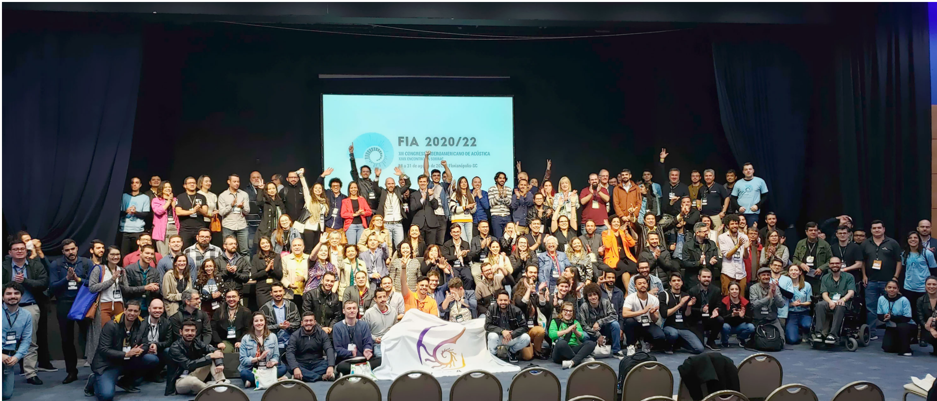
Figure 4: FIA 2020/22 participants at the Closing Ceremony.