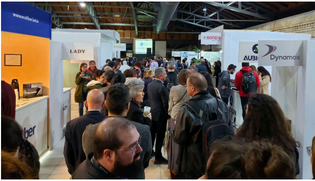
(c) Participants at the opening cocktail.