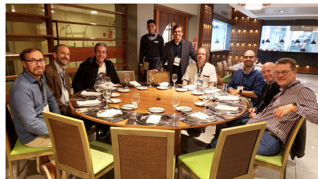
(f) Participants and organizers at the Networking Dinner.