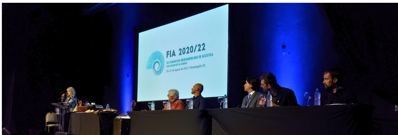
Figure 2: Organizing committee at the opening ceremony.