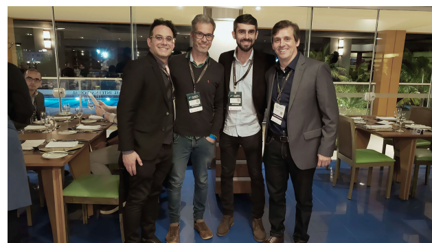
(h) Participants and organizers at the Networking Dinner.