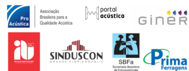
Figure 5: Sponsoring and supporting companies and institutions of the FIA 2020/22.