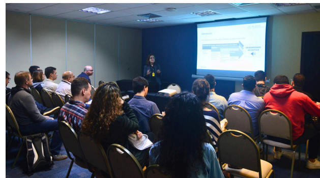
(b) Record of a mini-course conducted.