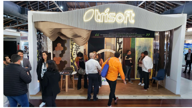
(d) Participants at the Exhibitors' Fair.