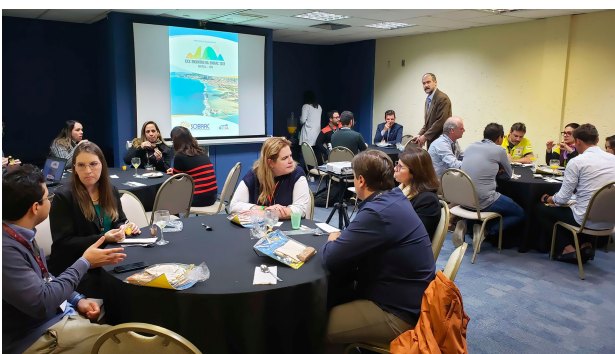
(g) Preparation for the XXX Sobrac Meeting in Natal, RN (2023).