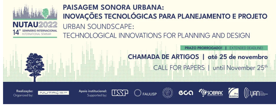
Figure 1: Call for the 14th International Seminar NUTAU 2022.

The fourteenth edition counted on the institutional support of the University of São Paulo and three of its units: the School of Architecture and Urbanism, the Polytechnic School (POLI USP), and the School of Communications and Arts (ECA USP). It also received support from Sobrac, ProAcústica, and the Young Acousticians Network.