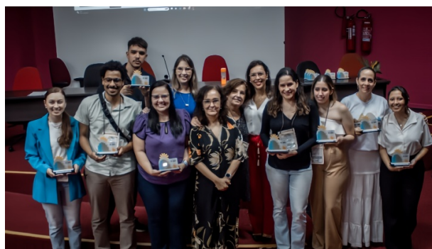
Figure 3: Photo of the winning teams with the III CACS committee.

For this contest, a logo was designed, making reference to the theme of the competition (colored pencils) and the logo of the XXX Sobrac Meeting (dune and sun), as shown in Figure 1 and present on the trophies in Figure 2.