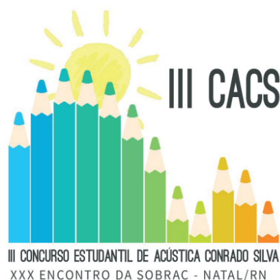
Figure 1: Official logo of the III CACS.

Inspired by the legacy of Conrado Silva, the III Conrado Silva Student Acoustic Contest — see the CACS logo in Figure 1 —, took place during